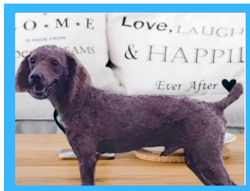
Marshall (Poodle Mini)