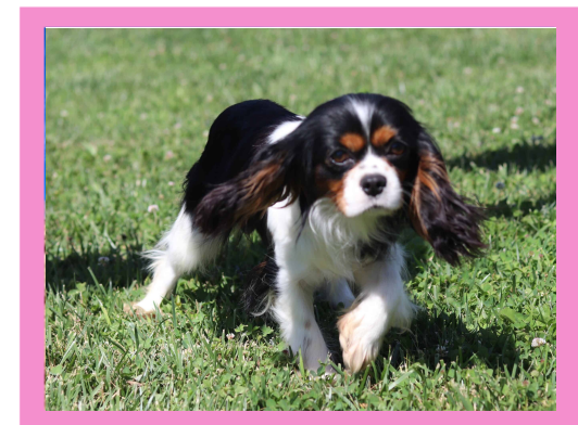
Snickers (Cavalier King Charles Spaniel)