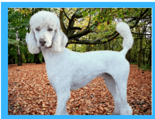
Captain (Poodle Standard)