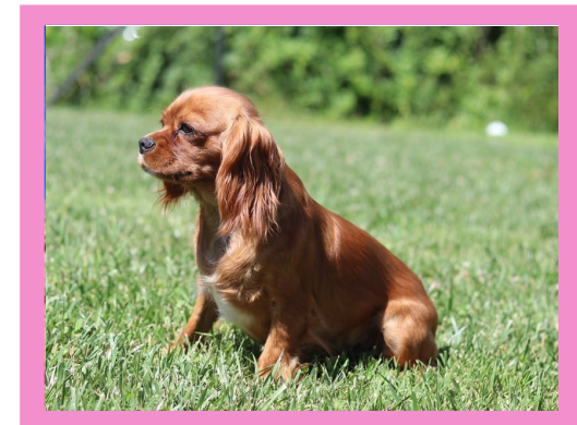
Ruby (Cavalier King Charles Spaniel)