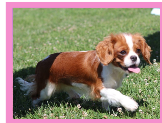
Kassie (Cavalier King Charles Spaniel)