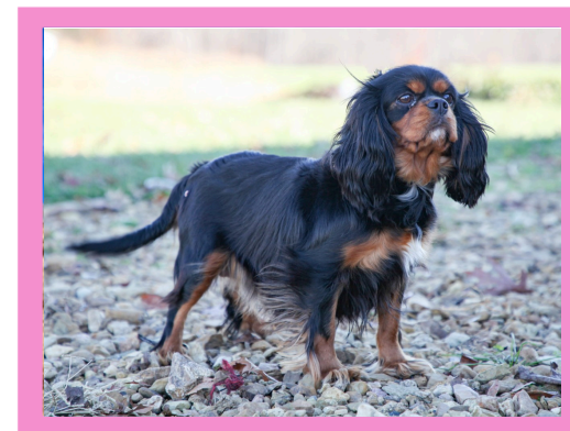
Emmie (Cavalier King Charles Spaniel)