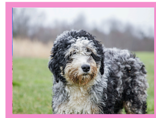
Queenie (Bernedoodle Mini)