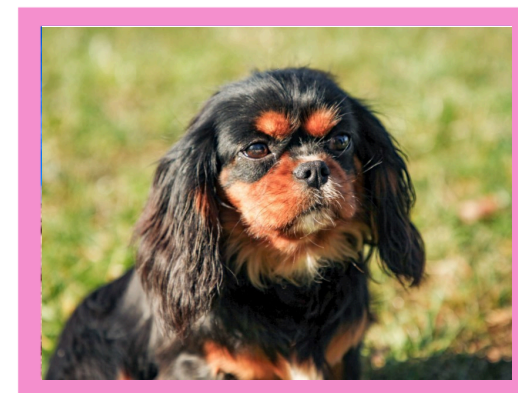
Bridget (Cavalier King Charles Spaniel)