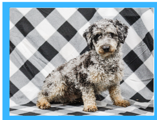
Frisky (Poodle Mini)